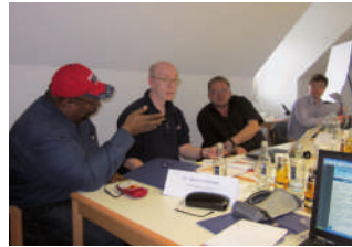
Photos: Working groups at previous seminars in Montabaur