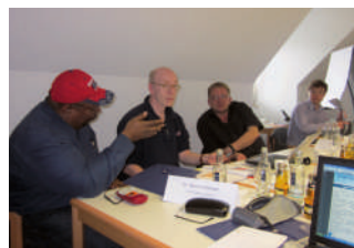
Photos: Working groups at previous seminars in Montabaur