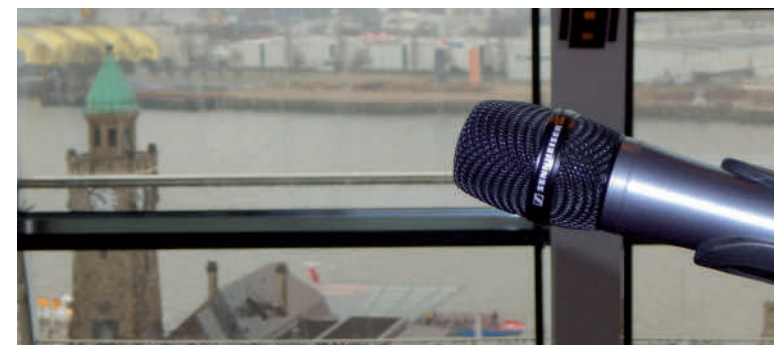
View of the St. Pauli Landing Piers from the conference room

Members of European Works Councils from EU countries as well as the Norway, Iceland and Liechtenstein can request central management for time-off work and to cover conference expenses under Article 10(4) of EU Directive 2009/38/EC. In most cases the EWC agreement or the SE Participation Agreement explicitly provides for an entitlement to training. This usually also applies to delegates from Switzerland, the UK and other non-EU countries. Members of European works councils governed by German law may attend in accordance with Article 38 (1) of the German EWC Act. Members of SE works councils governed by German law may participate in accordance with Article 31 of the SEBG. German works council members may attend in accordance with Article 37 (6) of the Works Constitution Act.