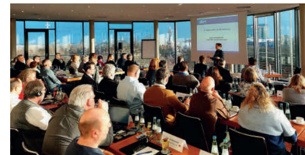
Last conference in January 2023 with almost 50 participants from six countries.

The Harbour Hotel Hamburg is located above the St. Pauli Landing Piers and offers an impressive view over the harbour and the river Elbe during the conference. Our rooms are located in the hotel’s new building the “Cabin Residence” and offer modern flair and functional comfort.