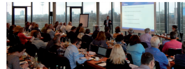
Last conference in January 2020 before the corona pandemic with almost 70 participants from nine countries

The Harbour Hotel Hamburg is located above the St. Pauli Landing Piers and offers an impressive view over the harbour and the river Elbe during the conference. Our rooms are located in the hotel's new building the "Cabin Residence" and offer modern flair and functional comfort.