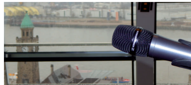
View of the St. Pauli Landing Piers from the conference room

Members of European Works Councils from EU countries as well as the United Kingdom, Norway, Iceland and Liechtenstein can request central management for time-off work and to cover conference expenses under Article 10 (4) of EU Directive 2009/38/EC. In most cases the EWC agreement or the SE participation agreement explicitly provides for an entitlement to training. This usually also applies to delegates from Switzerland and other non-EU countries. Members of European works councils governed by German law may participate in accordance with Article 38 (1) of the German EWC Act. Members of SE works councils governed by German law may participate in accordance with section 31 of the SEBG. German works council members may participate in accordance with section 37 (6) of the Works Constitution Act.