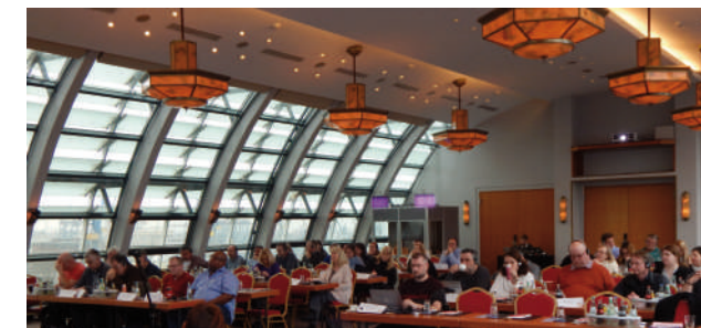
Last conference in 2019 with 52 participants from nine countries.

The waterfront Harbour Hotel Hamburg directly overlooks the St. Pauli Piers and will impress us during the seminar with its stunning views over the port and the river Elbe. The rooms reserved for us are located in the hotel's new building in the "Cabin Residence" and offer a modern design with functional comfort.