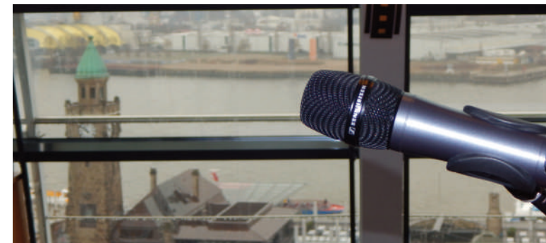
View from the conference venue to the St. Pauli Piers

EWC members from EU Member States as well as from Norway, Iceland and Lichtenstein can request central management for time-off work and to cover conference fees and travel expenses on the basis of article 10 (4) of the Directive 2009/38/EC. The EWC agreement or SE participation agreement usually makes explicit provisions for a right to training. In general these also apply to members from Switzerland and other non-EU countries. EWC members from companies which are subject to German legislation, are able to participate under the provisions of Article 38 (1) of the German EWC Act.